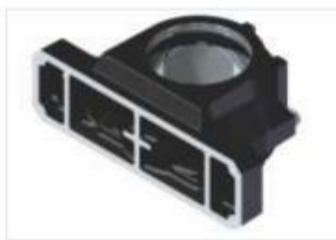
Sturdy base with Crossed Rib