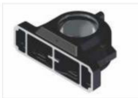
Sturdy base with Crossed Rib